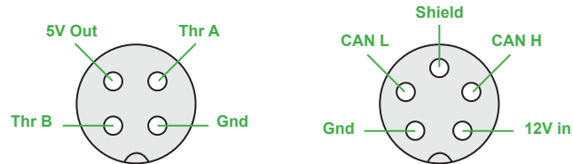
Pin identification for control wiring plugs

The MC600C uses two aviation-style screw-lock plugs for all control/low power connections – one with 4 pins for the throttle and one with 5 pins for power input and CAN bus connections. The diagram below shows pin identifications as viewed on the controller case.