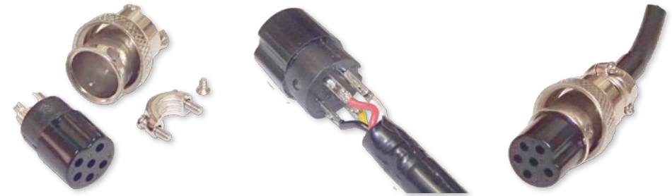
Example wiring of aviation plugs: Disassembled (left), wiring (middle), complete (right)

The shell also has a cable stress relief clamp at the rear which should be fastened down to hold the cables. If your cables are too small for the clamp to engage, you can wrap some insulation tape around them to increase the diameter and ensure the clamp is able to hold them in place.